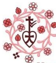
Humanitarian Aid Relief Trust